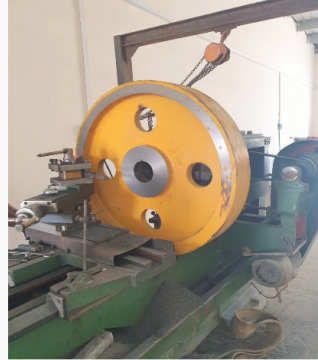
Pulley / Flywheel Machining