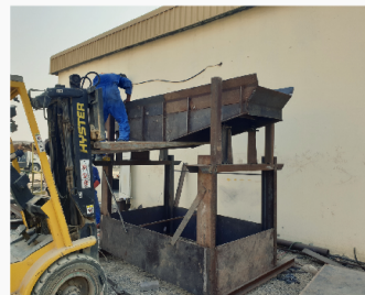
Mill / Screen